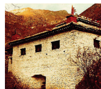
The "Temple Of Miraculous Fire" at Muktinath, Nepal. Photo by Ken Street (November 1979).

[For more on this subject, please read our tract The Temple Of Miraculous Fire. ]